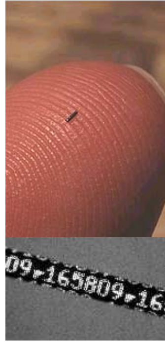
Figure 3. Coded wire tag – actual size and enlarged image.

Beginning in 1986 scientists at Hubbs-SeaWorld Research Institute started releasing cultured white seabass into coastal waters in southern California. Each fish is tagged internally in the cheek with a small, stainless steel coded wire tag (CWT). The purpose of this tag is to identify hatchery-reared fish from wild individuals. This CWT is not visible externally on the fish and can only be located by a specialized detection device. Some of the information obtained from tagged individuals includes their movement, diet, growth, and most importantly, survival rate. To date, we have received limited information, especially from legal-sized ( \geq 28 " ) individuals. This is where we need your help – we need white seabass heads!